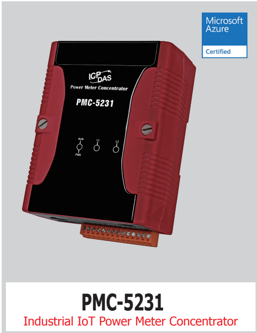
PMC-5231 Industrial IoT Power Meter Concentrator